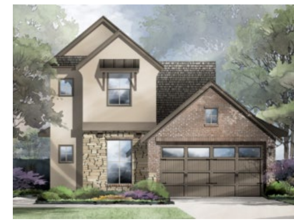
1115 Havenwood Lane $615,000 2,173 Sq. Ft., 3 Bed, 2.5 Bath 2 Story, 2 Car Garage