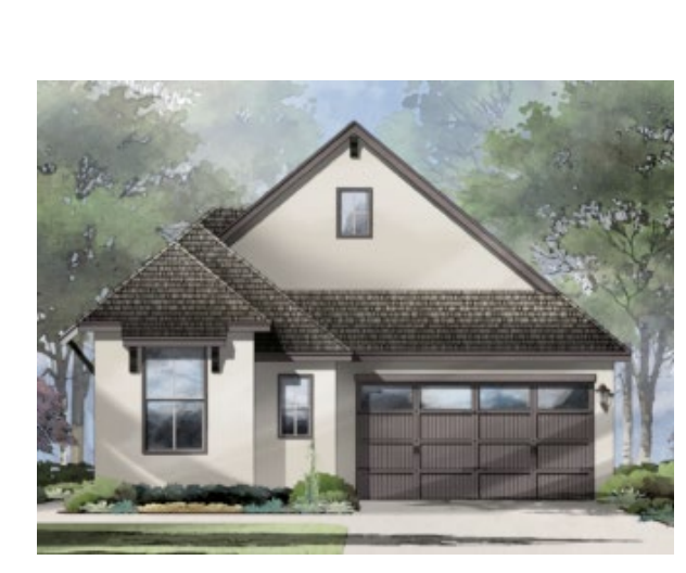
1200 Havenwood Lane $545,000 1,612 Sq. Ft., 2 Bed, 2 Bath 1 Story, 2 Car Garage