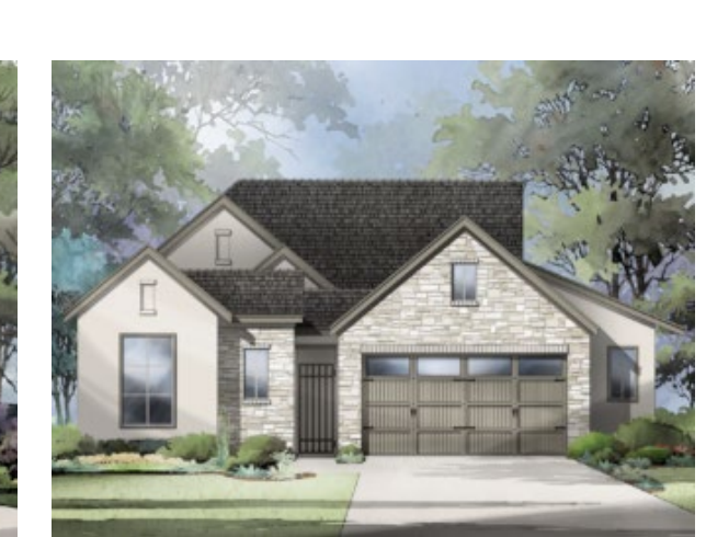
1202 Havenwood Lane $643,000 2,050 Sq. Ft., 3 Bed, 3 Bath 1 Story, 2 Car Garage