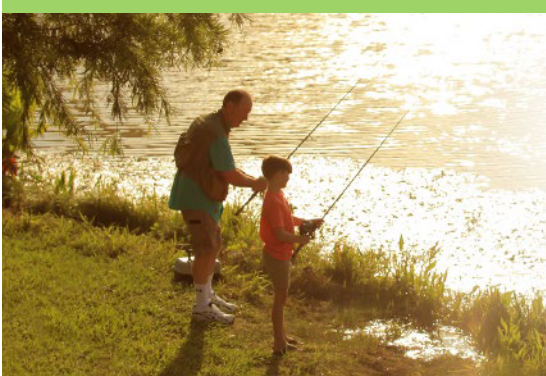
Catch & Release Ponds