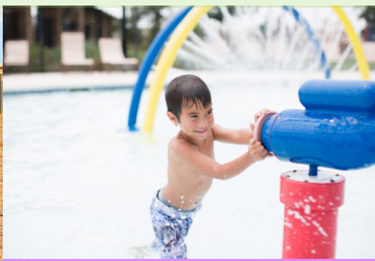
Sunbright Activity Center