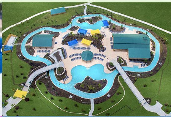
Lazy River Amenity Center