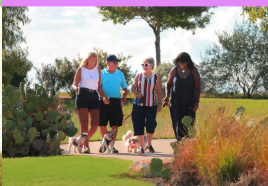
Miles of Trails