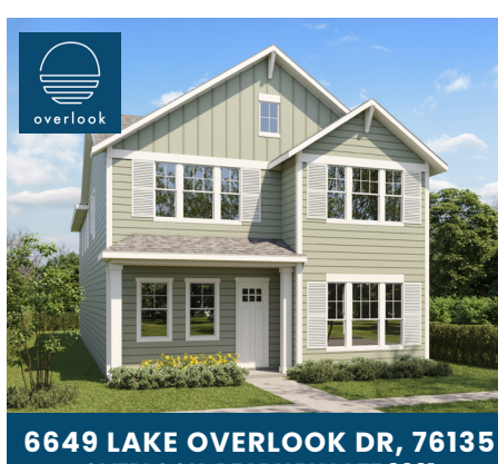
OVERLOOK, READY BY LATE 2021 $439,900 | 2576 sqft | 4 Bed, 3.5 Bath, 2 Car Garage