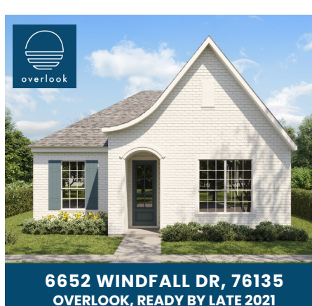
OVERLOOK, READY BY LATE 2021