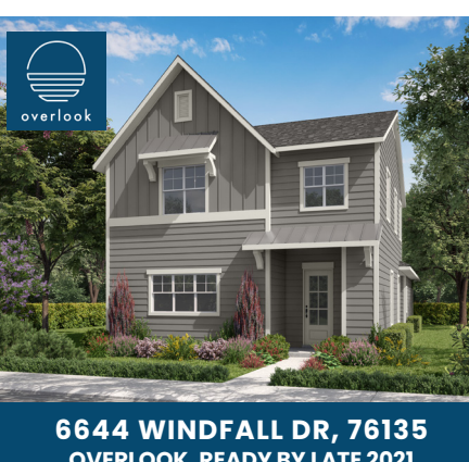
OVERLOOK, READY BY LATE 2021 $450,562 | 2362 sqft | 4 Bed, 3.5 Bath, 2 Car Garage