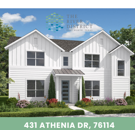
431 ATHENIA DR, 76114 RIVER DISTRICT, READY BY SPRING $442,200 | 1734 sqft | 3 Bed, 2.5 Bath, 2 Car Garage