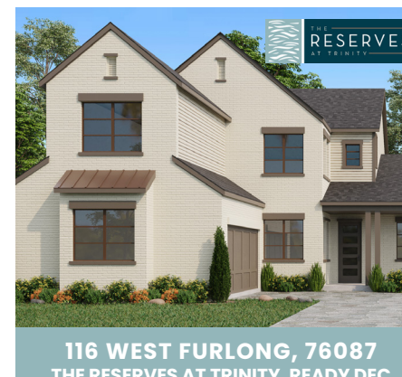
116 WEST FURLONG, 76087 THE RESERVES AT TRINITY, READY DEC $555,000 | 2914 sqft | 4 Bed, 3 Bath, 2 Car Garage