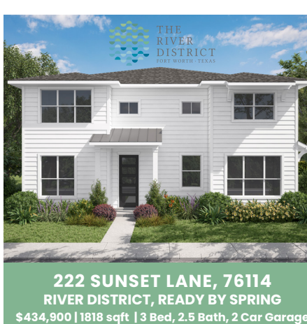
RIVER DISTRICT, READY BY SPRING $434,900 | 1818 sqft | 3 Bed, 2.5 Bath, 2 Car Garage