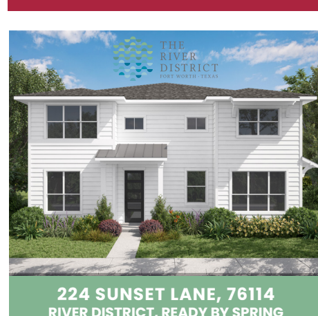
RIVER DISTRICT, READY BY SPRING $435,750 | 1818 sqft | 3 Bed, 2.5 Bath, 2 Car Garage