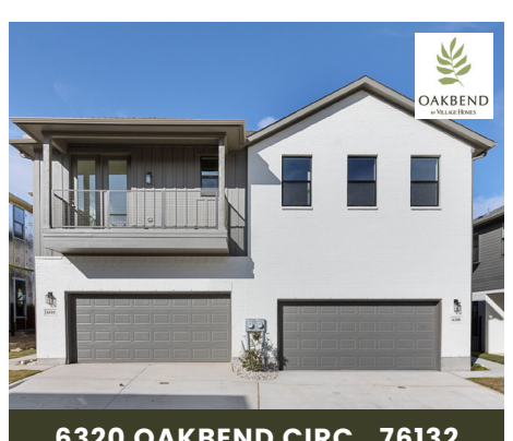
6320 OAKBEND CIRC., 76132 OAKBEND, READY BY SPRING $421,319 | 1981 sqft | 3 Bed, 2.5 Bath, 2 Car Garage