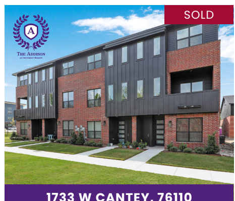
1733 W CANTEY, 76110 THE ADDISON, READY BY SPRING'22 1942 sqft | 3 Bed, 3.5 Bath, 2 Car Garage