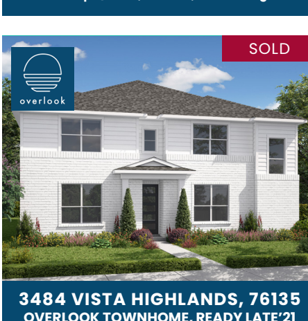
3484 VISTA HIGHLANDS, 76135 OVERLOOK TOWNHOME, READY LATE'21 1738 sqft | 3 Bed, 2.5 Bath, 2 Car Garage