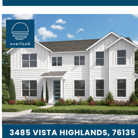
3485 VISTA HIGHLANDS, 76135 OVERLOOK TOWNHOME, READY LATE'21 $316,900 | 1632 sqft | 3 Bed, 3.5 Bath, 2 Car Garage