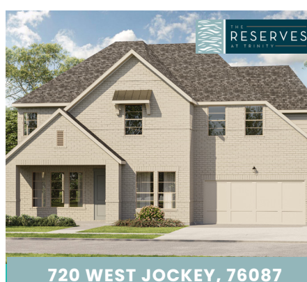
720 WEST JOCKEY, 76087 THE RESERVES AT TRINITY $536,537 | 3135 sqft | 4 Bed, 2.5 Bath, 3 Car Garage