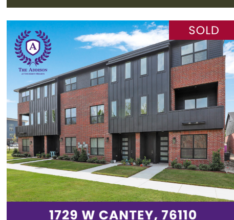
1729 W CANTEY, 76110 THE ADDISON, READY BY SPRING'22 1881 sqft | 3 Bed, 3.5 Bath, 2 Car Garage