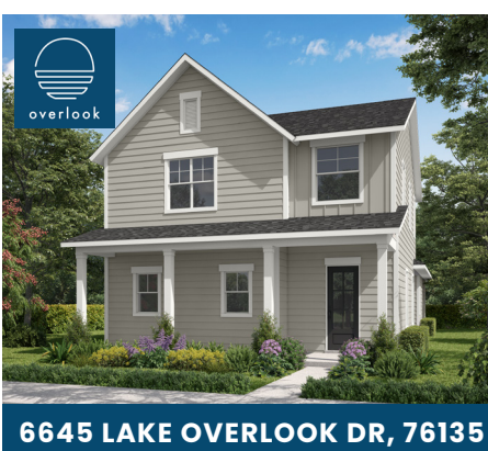
6645 LAKE OVERLOOK DR, 76135 OVERLOOK, READY BY LATE 2021 $434,900 | 2381 sqft | 4 Bed, 3.5 Bath, 2 Car Garage