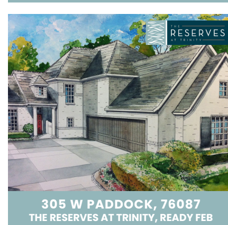
305 W PADDOCK, 76087 THE RESERVES AT TRINITY, READY FEB $536,251 | 2805 sqft | 4 Bed, 3.5 Bath, 2 Car Garage