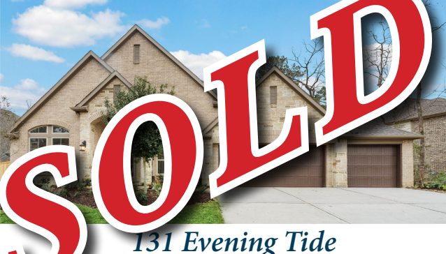
131 Evening Tide 3½ BATH | 1 STORY | 3 CAR | 2,870 SQ.FT.