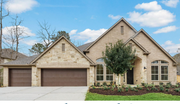
108 Verdancia Park Court 4 BED | 3½ BATH | 1 STORY | 3 CAR | 2,870 SQ.FT. NOW $585,900 | EARNINGS $17,577